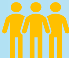
Field Force Management