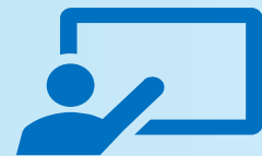
Primary & Secondary Sales Management